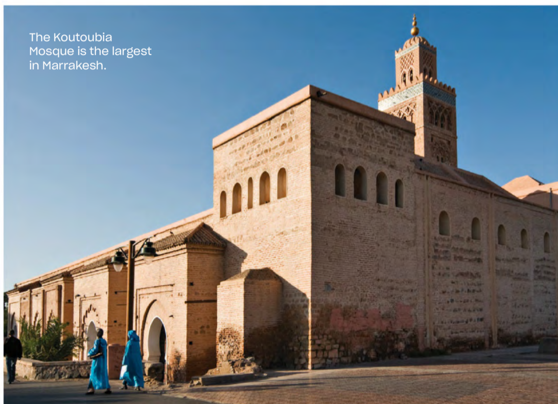
The Koutoubia Mosque is the largest in Marrakesh.