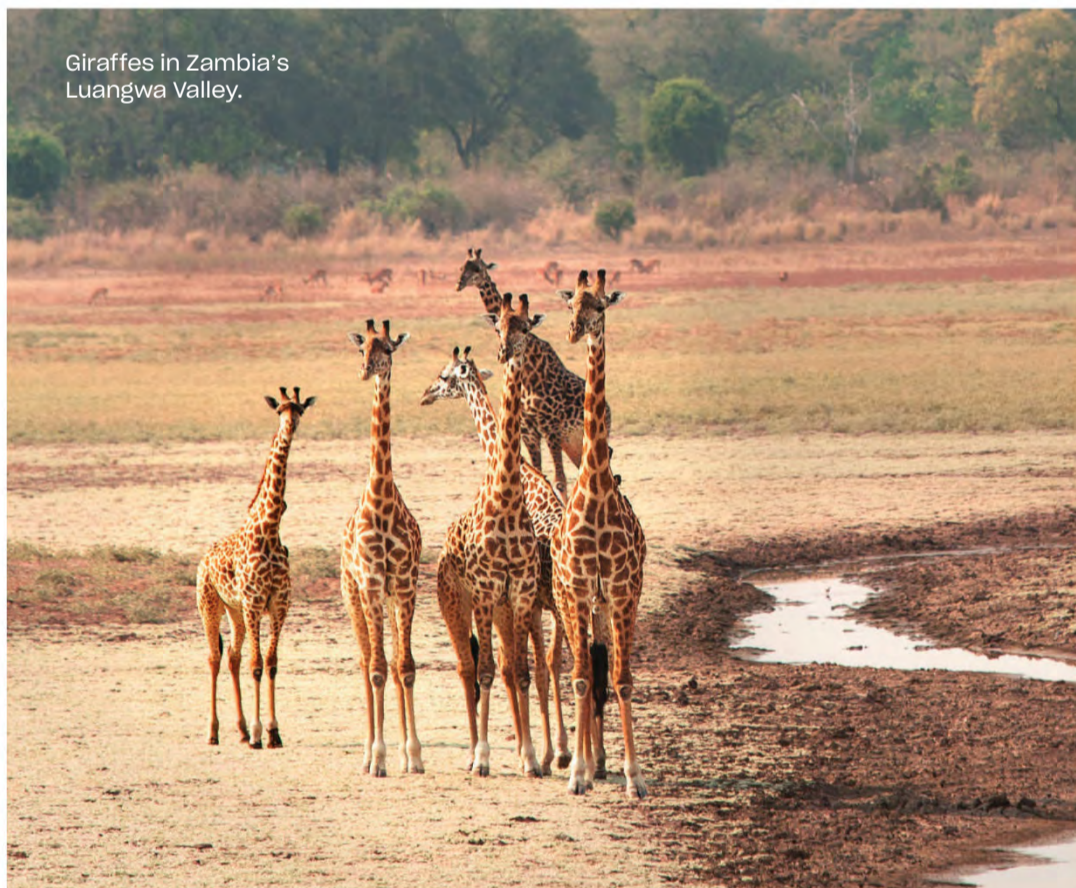
Giraffes in Zambia's Luangwa Valley.

With an encyclopedic knowledge of the top camps in Botswana, Kenya, and Uganda, Beal is adept at luxury stays. He's particularly excited about two new South Africa destinations: the six-tent, eco-friendly Loapi Camp, in the Tswalu Kalahari private game reserve, and the Farmstead at Royal Malewane, a high-end lodge next to Kruger National Park. Average daily spend: $1,600. craigb@travelbeyond.com; travelbeyond.com.