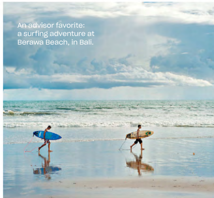
An advisor favorite: a surfing adventure at Berawa Beach, in Bali.