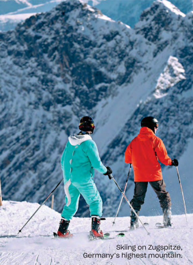
Skiing on Zugspitze, Germany's highest mountain.