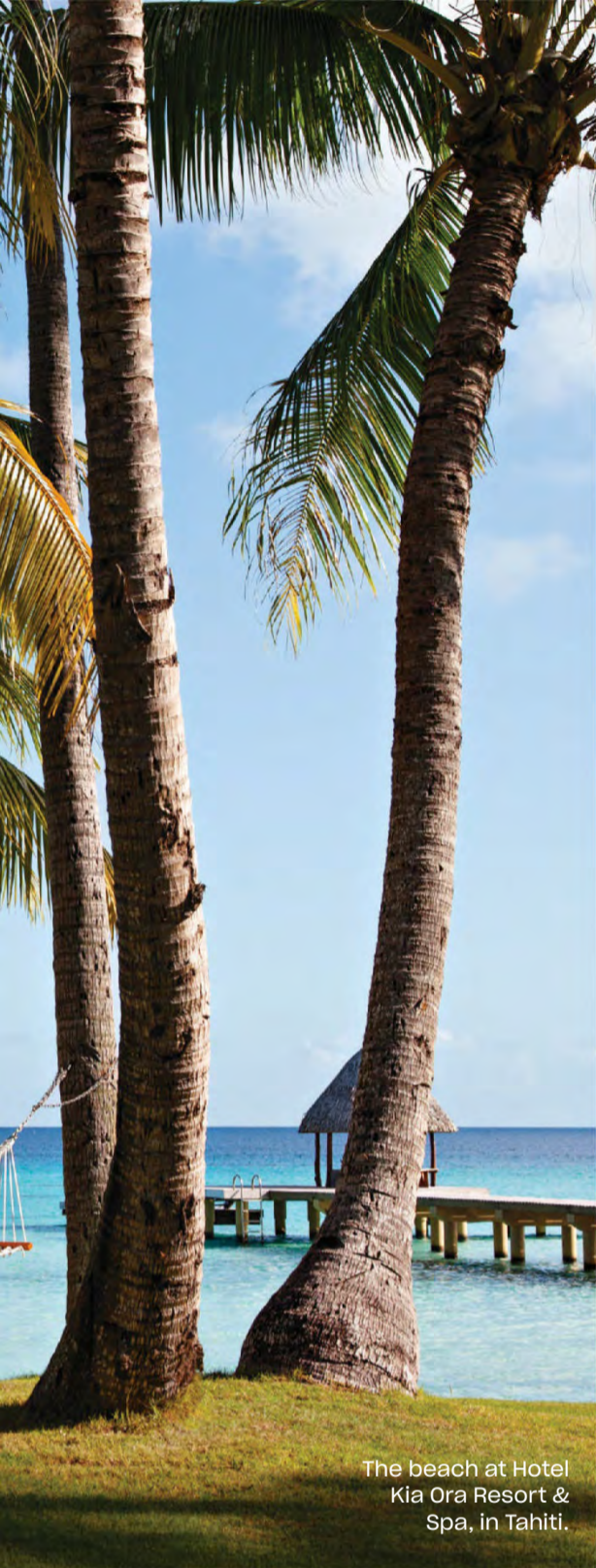
The beach at Hotel Kia Ora Resort & Spa, in Tahiti.