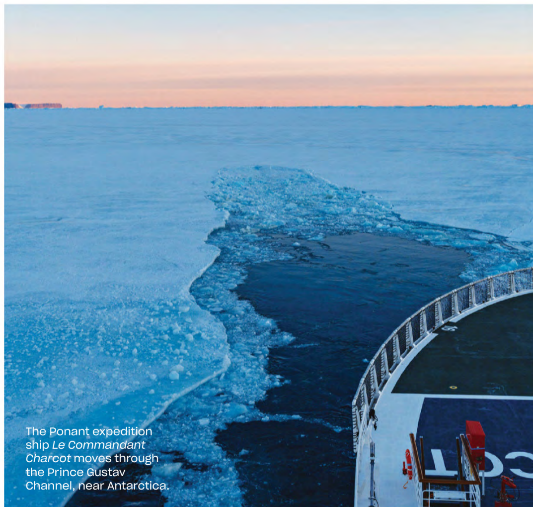
The Ponant expedition ship Le Commandant Charcot moves through the Prince Gustav Channel, near Antarctica.