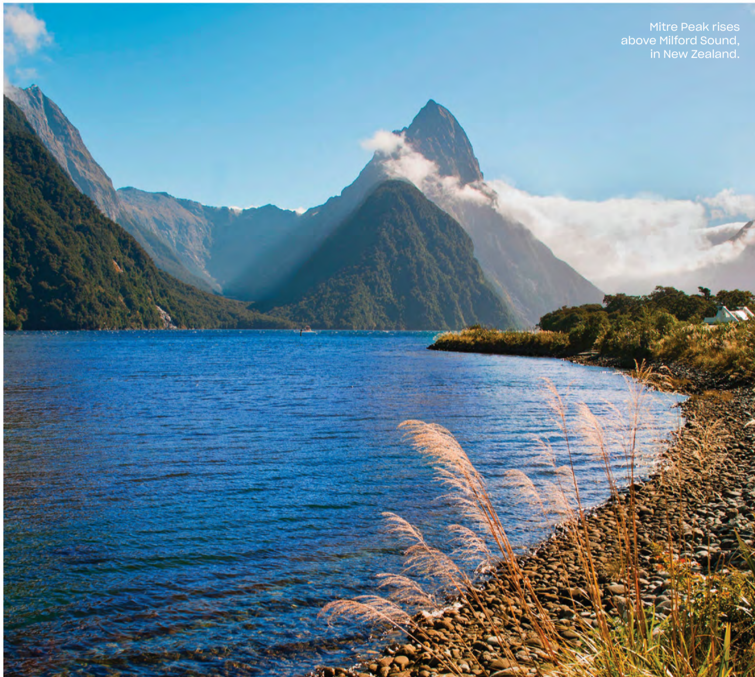
Mitre Peak rises above Milford Sound, in New Zealand.