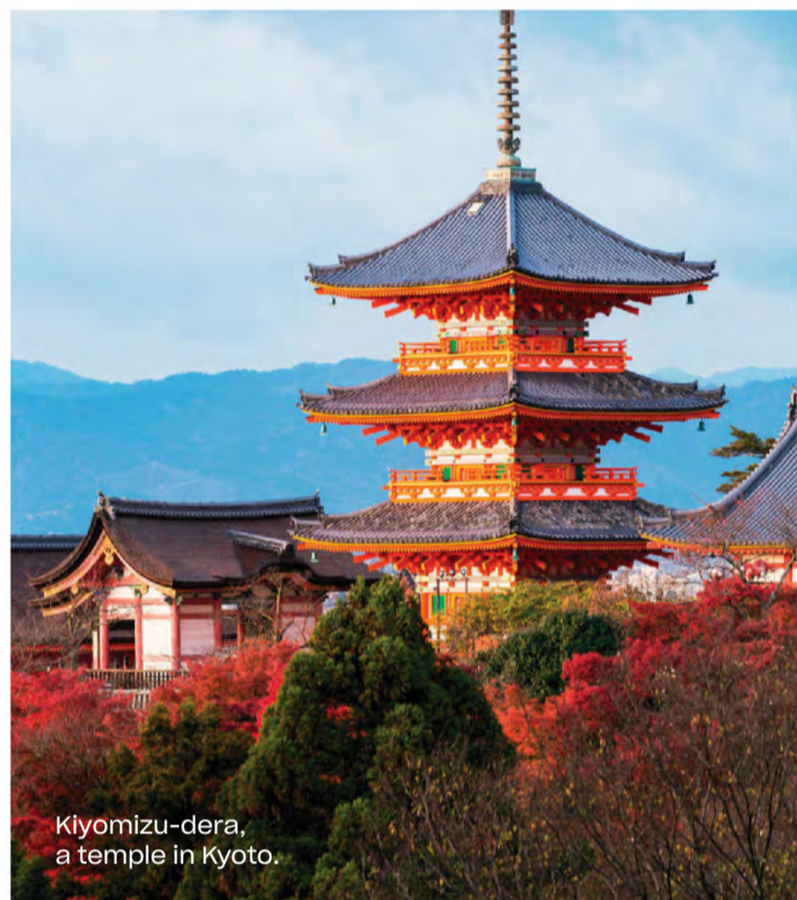
Kiyomizu-dera, a temple in Kyoto.

Whether it's a client's first visit or a return trip, Gilman seeks out under-the-radar experiences, such as a private tour of a tea estate in the town of Uji, outside Kyoto, where matcha cultivation is thriving, or sailing the Inland Sea on a 19-room yacht that feels like an intimate floating ryokan . Average daily spend: $2,300. scott@japanquestjourneys.com ; japanquestjourneys.com .