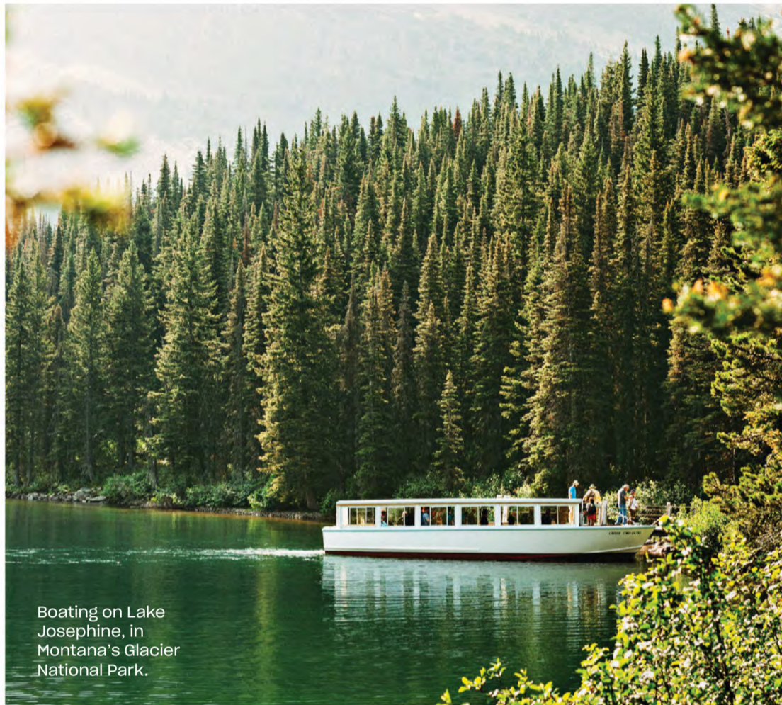
Boating on Lake Josephine, in Montana's Glacier National Park.