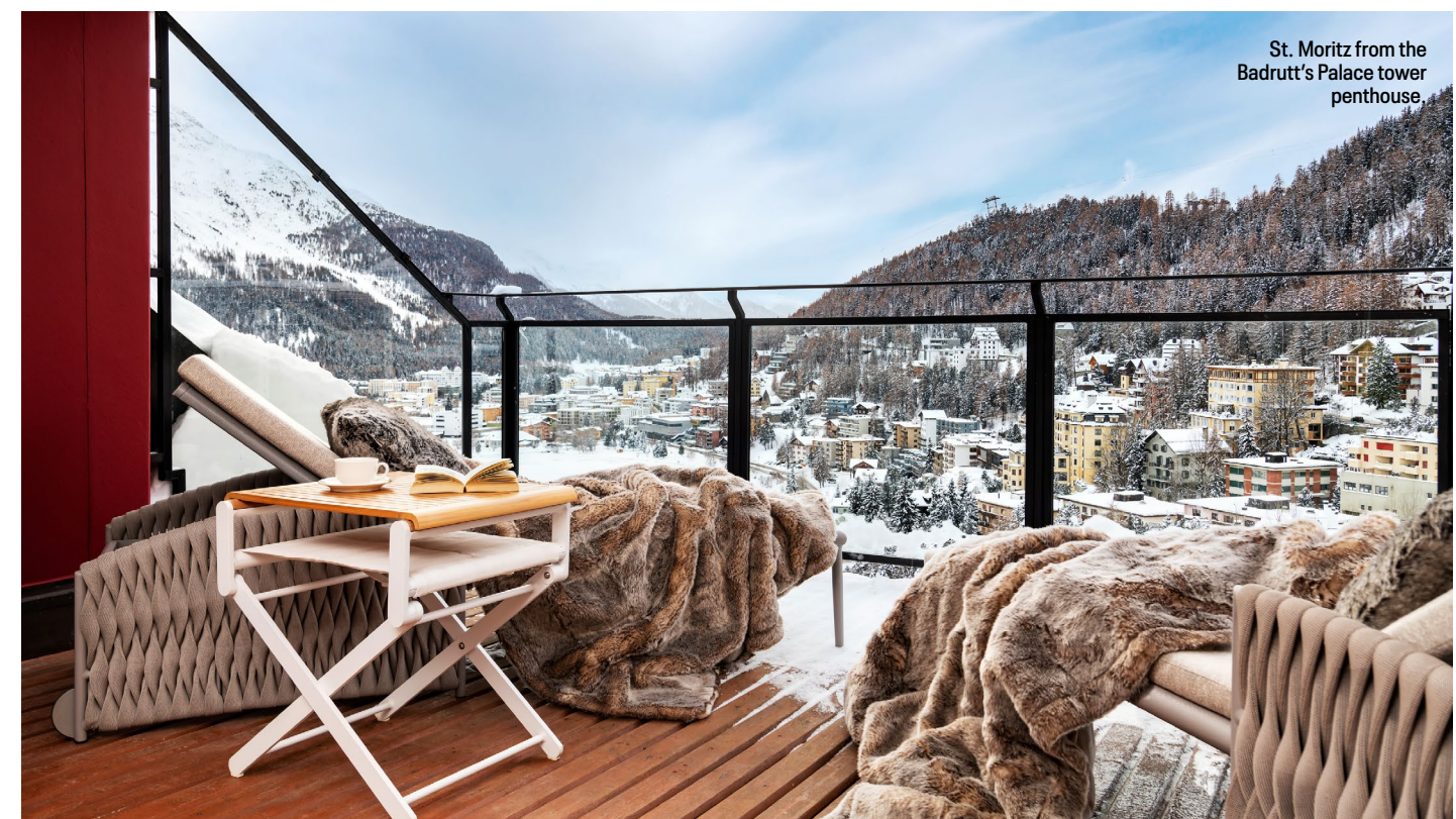
St. Moritz from the Badrutt's Palace tower penthouse.

► Off-piste Sledding isn't just for kids here. St. Anton's 2.5-mile run will deposit you at Thony's Barn restaurant, in a Tyrolean barn. J.M.