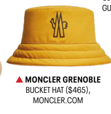
▲ MONCLER GRENABLE BUCKET HAT ($465), MONCLER.COM