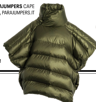
▶ PARAJUMPERS CAPE ($545), PARAJUMPERS.IT