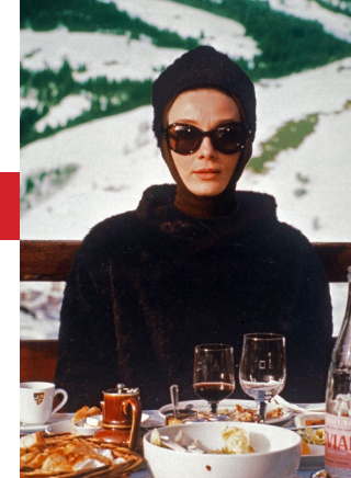
Audrey Hepburn in the opener of Charade , filmed in Megève.

VAL D'ISERE France A set of serious skiers, put off by Courchevel's ostentation, migrated to snow-sure Val d'Isère, 80 minutes away.