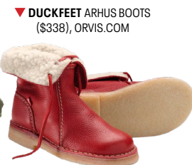
▼ DUCKFEET ARHUS BOOTS ($338), ORVIS.COM