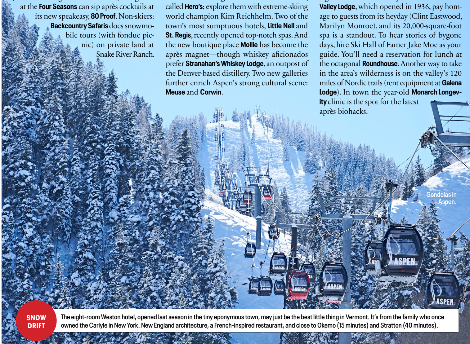
Gondolas in Aspen.