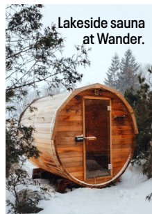
Lakeside sauna at Wander.