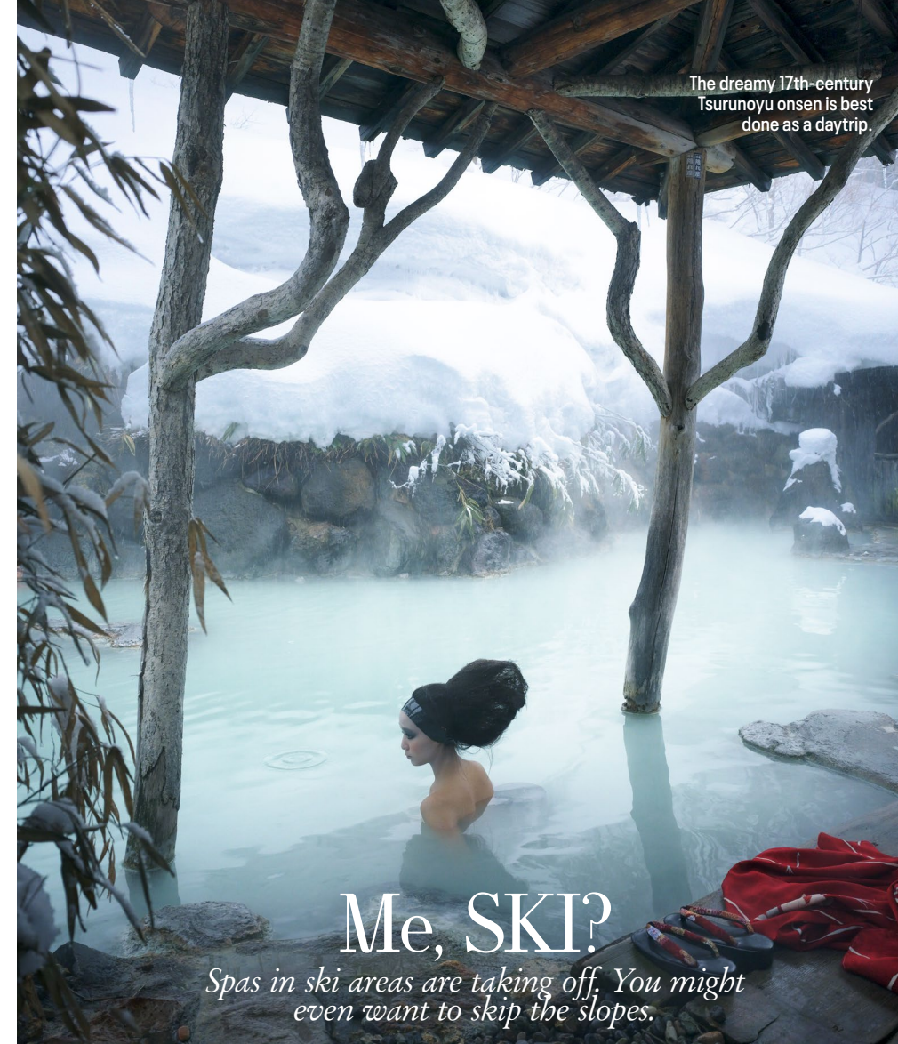
The dreamy 17th-century Tsurunoyu onsen is best done as a daytrip.

ENTREÉ DESTINATIONS (YUKON CABIN); WANDER THE RESORT (SAUNA); CHRISTIAN REMOY (ALESUND)