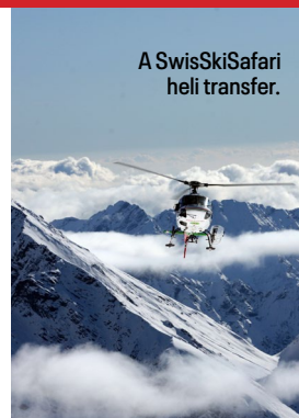
A SwissSkiSafari heli transfer.

DOLOMITE MOUNTAINS Italy Founder Agustina Marmol has spent decades researching the best ski runs, restaurants, and rifugios. A seven-day safari might start at Cortina d'Ampezzo and end at the Alta Badia ski area. Tour