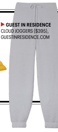
▶ GUEST IN RESIDENCE CLOUD JOGGERS ($395), GUESTINRESIDENCE.COM