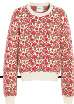
◀ BARRIE SWEATER ($1,895), BARRIE.COM

You'll mostly be wearing extreme weather gear. But you have to live a little.