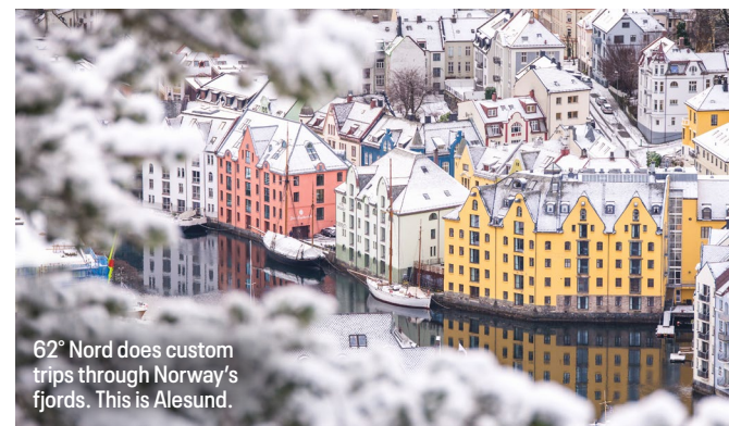
62° Nord does custom trips through Norway's fjords. This is Alesund.