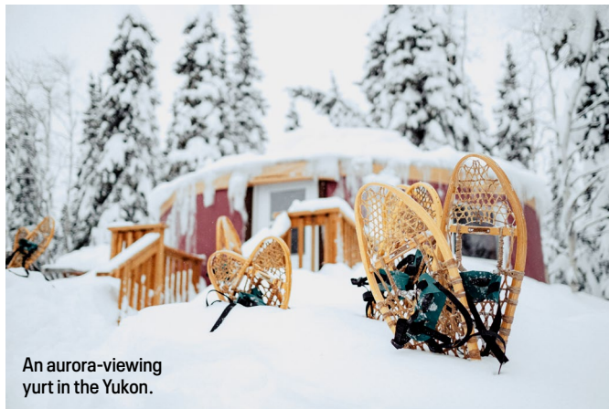
An aurora-viewing yurt in the Yukon.