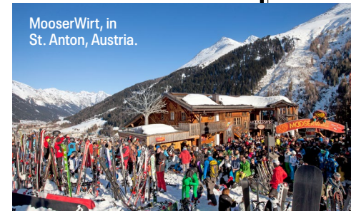
MooserWirt, in St. Anton, Austria.

OFF-PISTE (Stay late—your chalet is just a taxi ride away.) The royals are fans of the clubs at Farinet, the hotel in the heart of Verbier, Switzerland . Everyone has boogied under the neon lights of GreenGo, a 1970s-inspired disco in Switzerland's Gstaad Palace. Do not miss line dancing to live country bands in Jackson, Wyoming's Million Dollar Cowboy bar (but do swap ski boots for cowboy ones).